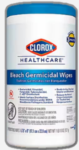
Clorox Healthcare Bleach Germicidal Wipes