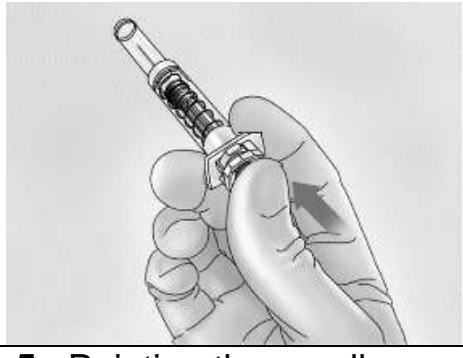
5. Pointing the needle away from you and others, activate the safety system by firmly pushing the plunger rod. The protective sleeve will automatically cover the needle.