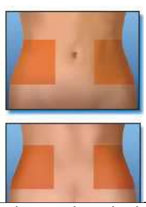
1. Wash your hands thoroughly using soap and water. Sit or Lie in a comfortable position. Clean the area where you are going to give the injection with alcohol. This should be about 2 inches from the navel.