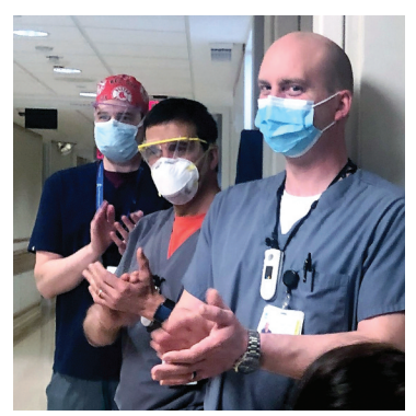
Staff applauding recovering patient

To make a donation to one of the employee assistance funds or to support the continuation of excellence at Bassett contact the Friends office at 607-547-3928, or make a gift online at www.friendsofbassett.org. ■