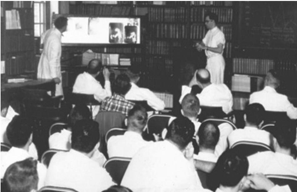
Early days of faculty development at Bassett (1957)