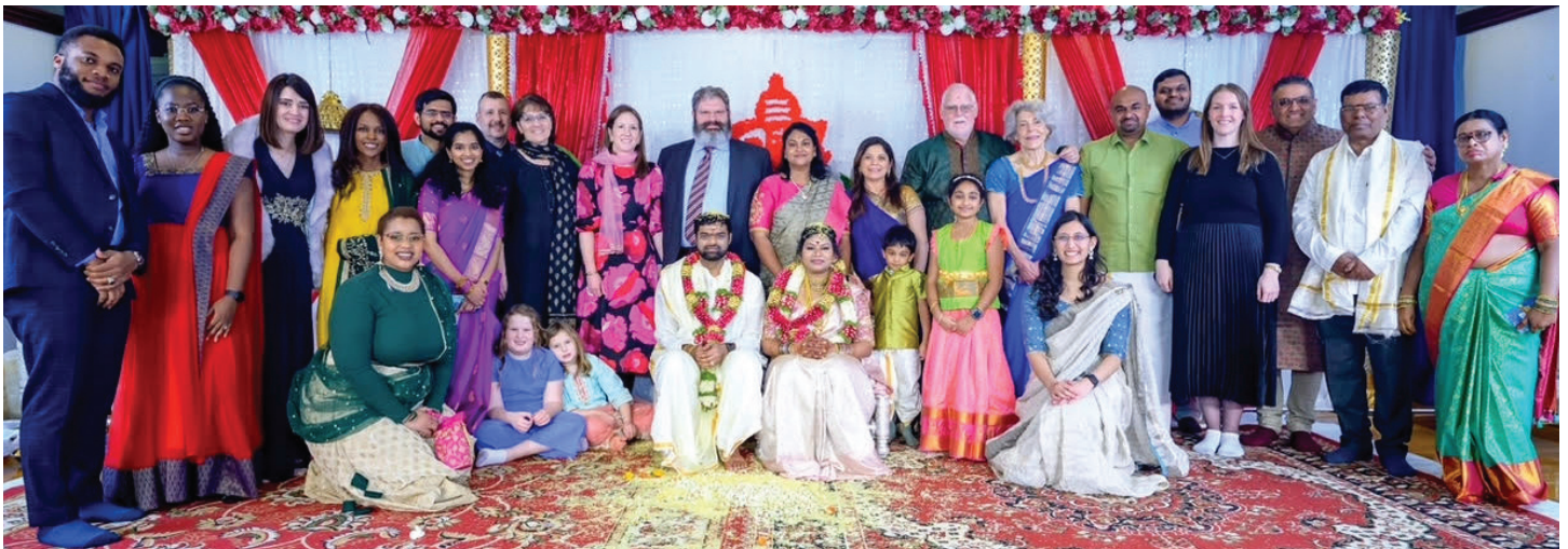
The Bassett contingent, their families, and other friends and family at the wedding