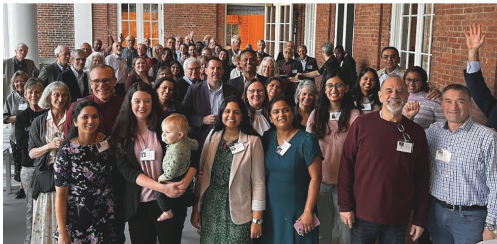
Alumni, current staff and their family members gathered for a welcoming reception on the veranda of The Otesaga Resort Hotel on a mild autumn evening.