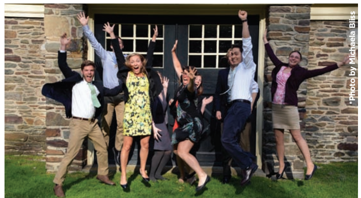
Graduates jumping for joy.

And you are students of the Columbia-Bassett Medical School program or students who spent your final two years of medical school at Bassett.