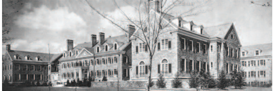
Below: The hospital in 1920.