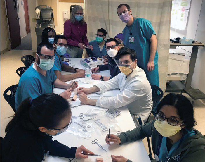
Surgery residents participating in a suturing lab in the active learning center.